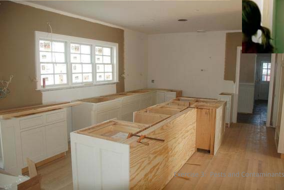
Exercise 3: Pests and Contaminants