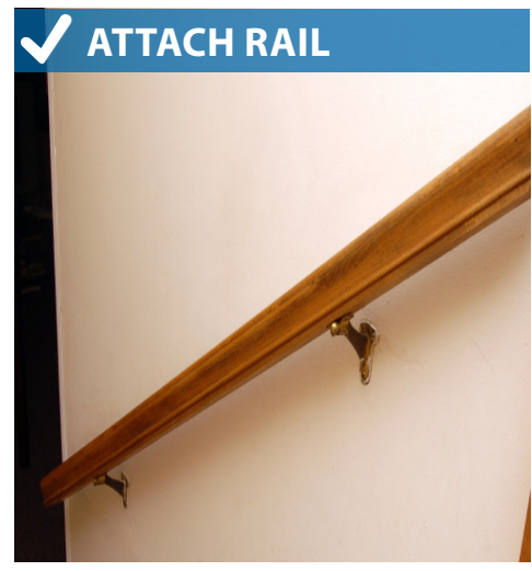
Copyright ©2011 Advanced Energy. All Rights Reserved

8. Attach hand rail to brackets on the wall.