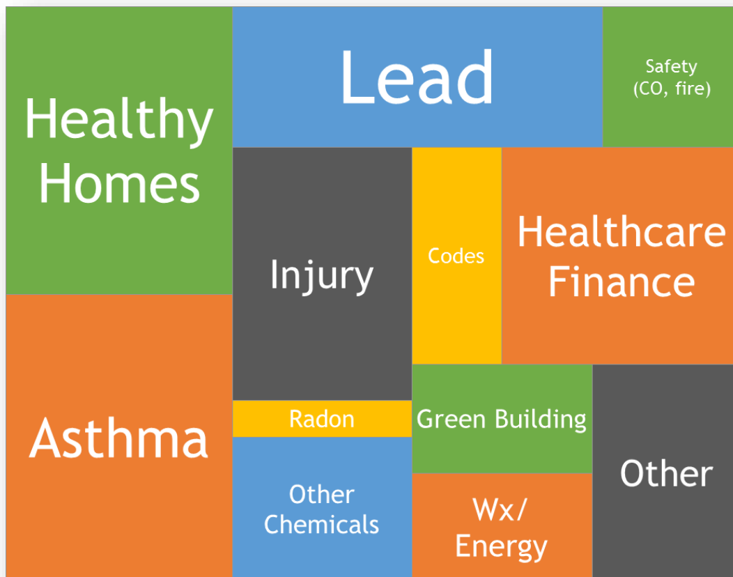
A visualization of NCHH's 2015 projects by frequency of primary topic.

As a result of these ongoing activities, NCHH expects to increase healthcare investment in housing, reduce the prevalence of housing-related illness and injury, and reduce housing-related health disparities. Ultimately, NCHH envisions a future in which 100% of the U.S. population will have regular and unquestionable access to comprehensive services to prevent and reduce housing illness and injury. The Housing as Healthcare campaign is the critical next step in realizing this vision and our work to demystify the healthcare financing landscape is the first step in that campaign.