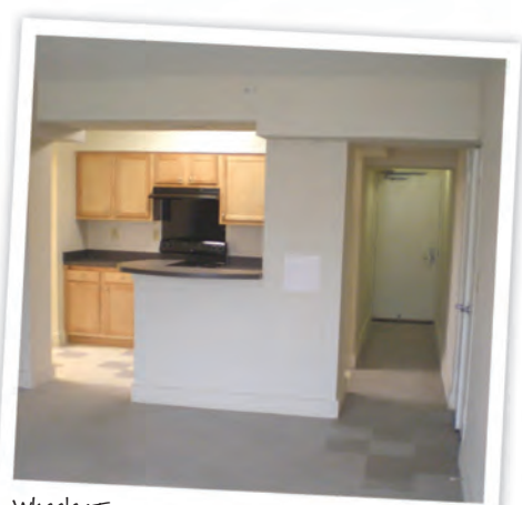
Wheeler Terrace Renovated apartment

The evaluation of how the green and healthy features integrated into the Wheeler Terrace rehabilitation are impacting resident health and exposure to allergens is ongoing. Post-renovation interviews with residents and analysis began in fall 2010 and will be completed in 2011. In addition to the evaluation, NCHH is training several residents as Community Health Workers (CHW) to provide healthy home information to other community members. Heightening the resident connection and encouraging peer education should help build resident engagement in maintaining healthy homes.