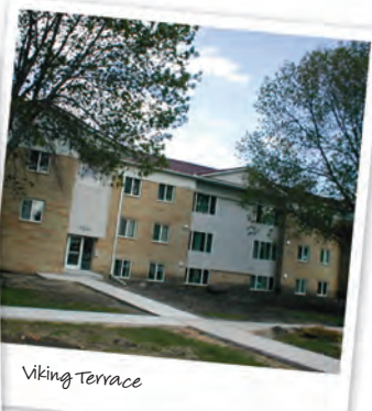
Viking Terrace's New Picnic Shelter