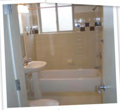
Post construction bathroom