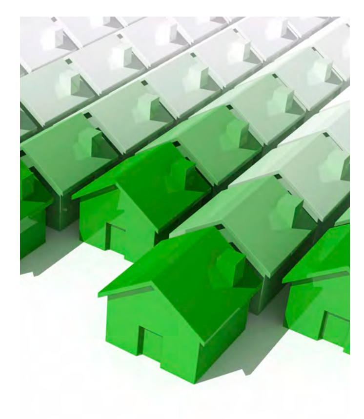
health benefits for residents along with the potential to move the housing market toward healthier building practices.

Most had criteria related to improving ventilation and reducing moisture, but none addressed home injuries; and the criteria inconsistently addressed contaminants such as radon and pesticides. The only program focused on the most vulnerable population when it came to housing and health-related issues (i.e., low-income families) was Enterprise Green Communities, which is designed specifically for affordable housing. The overall analysis, however, found that green building programs offer substantial