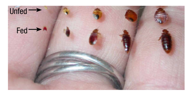
Bed bugs at various stages of growth.

It is a summary and evaluation of the methods used to control bed bugs based on published research, trade magazine articles, and interviews with practitioners and