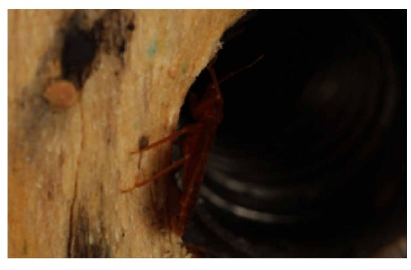
Bed bug crawling into a screwhole to hide.

Regardless of how the PMP plans to control bed bugs, whoever is responding to a bed bug report should start with visual inspection to understand the extent of the infestation. PMPs, cleaning contractors, landlords, and residents alike should look for all life stages of bed bugs in the hot spots. Research shows that the locations where bed bugs are most often found (in order of most to least often infested) are beds, bedding, baseboard/carpet edges, furniture such