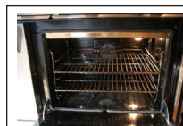
Remove oven racks and clean by hand