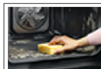
After oven has cooled, wipe up any ash