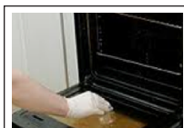
Wipe up spills and messes in the oven