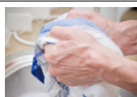
Scrub with a cloth and warm water