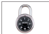
Lock oven door!