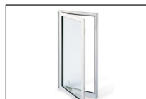
Open a window near the oven or turn on the range hood fan