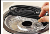
Remove the burners

For hard to wash, stuck-on grease, combine a mixture of equal parts of baking soda and water and allow to sit for about 30 minutes to form a paste. Using a clean cloth, scrub the burner with the baking soda paste until the debris is gone. If this doesn't help, leave the paste on the element for at least 20 minutes and then scrub again. Rinse everything with warm water and dry the coils with a clean cloth.